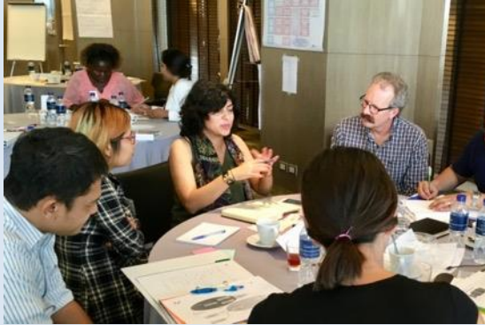
2017 Advanced RM Training Workshop participants discussing a case

"This was one of the most useful and insightful trainings I have attended. The participants had a lot to share."