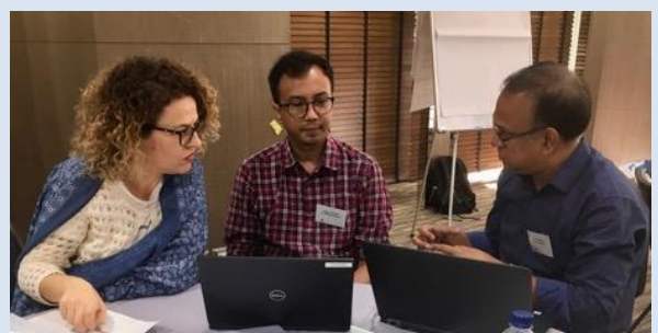
2019 Advanced RM Training Workshop participants

Results measurement enables programs to learn from experience so that they can maximise sustainable impacts, and report results credibly to program stakeholders. The spread of the DCED Results Measurement Standard and other initiatives have contributed to improving practice around the world. Yet, even experienced results measurement practitioners encounter challenges, particularly as programs mature or expand into demanding new areas.