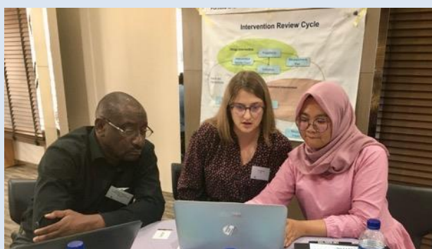
Participants working on a case assignment, November 2019

Learning from the workshop is shared with the wider development community. Click to read a paper that was informed by the 2019 workshop.