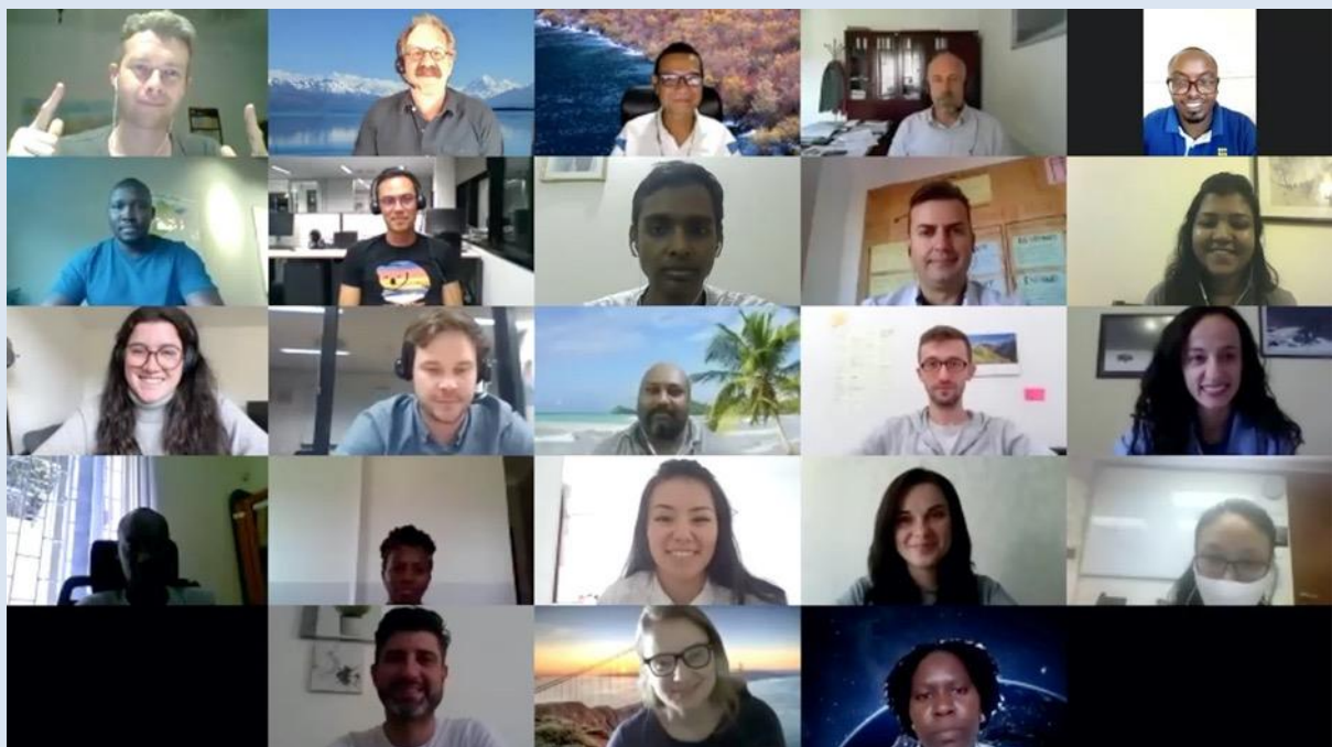
Participants in the online RM-PSD course, October 2020.

"The method of delivery is not your ordinary training method but providing a natural learning environment where the participants create most of the learning."