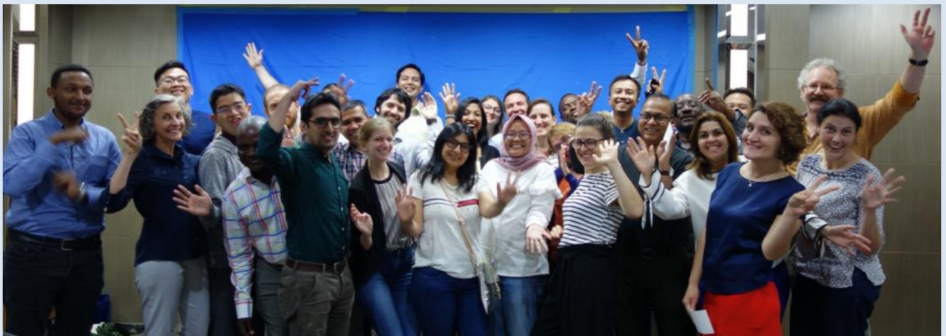
2019 Advanced RM Training Workshop Group

To attend this training workshop, you must have at least 2 years of practical experience applying the DCED Results Measurement Standard. If you do not meet these requirements, HPC and MCL offer other courses in this field.