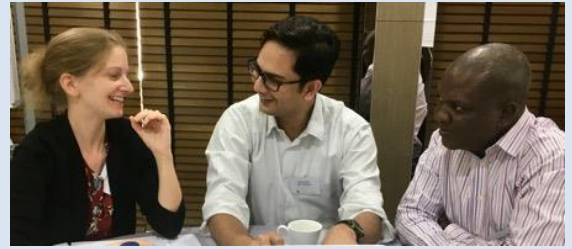
Participants tackling challenges in groups, November 2019

You will leave the training workshop with new knowledge, improved skills, practical tips, more confidence and a network of experienced colleagues.