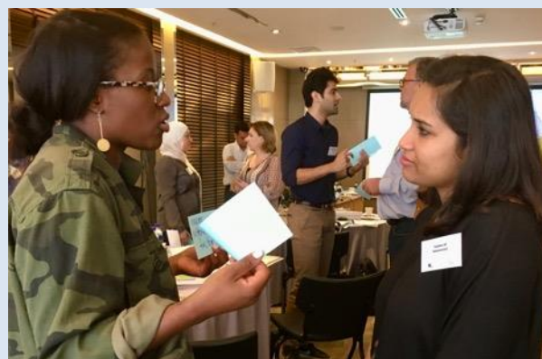
2017 Advanced RM Training Workshop participants